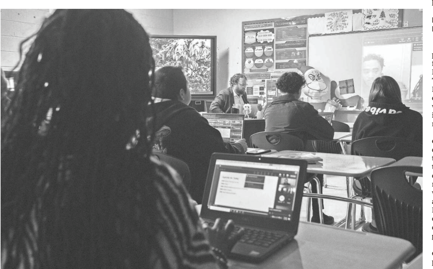
Antioch students were given the same workload, assignments and exams as undergraduates taking the class at Stanford.