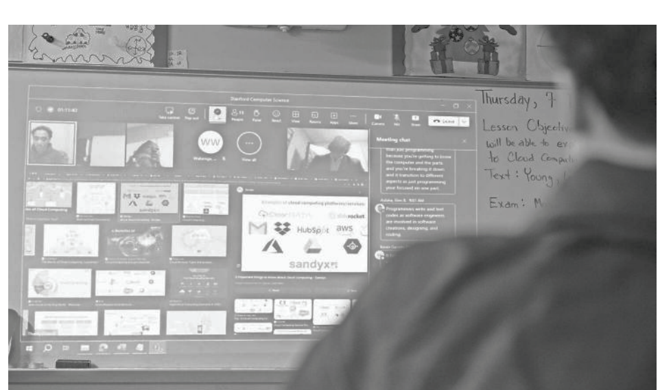
By the end of the class, Antioch students learned the basics of how computers and the internet function, along with introductory HTML and Python skills.

Learn more about the district's dual enrollment options, along with other parts of its college and career readiness program, at mnps.org/learn/academics/college_career_readiness.